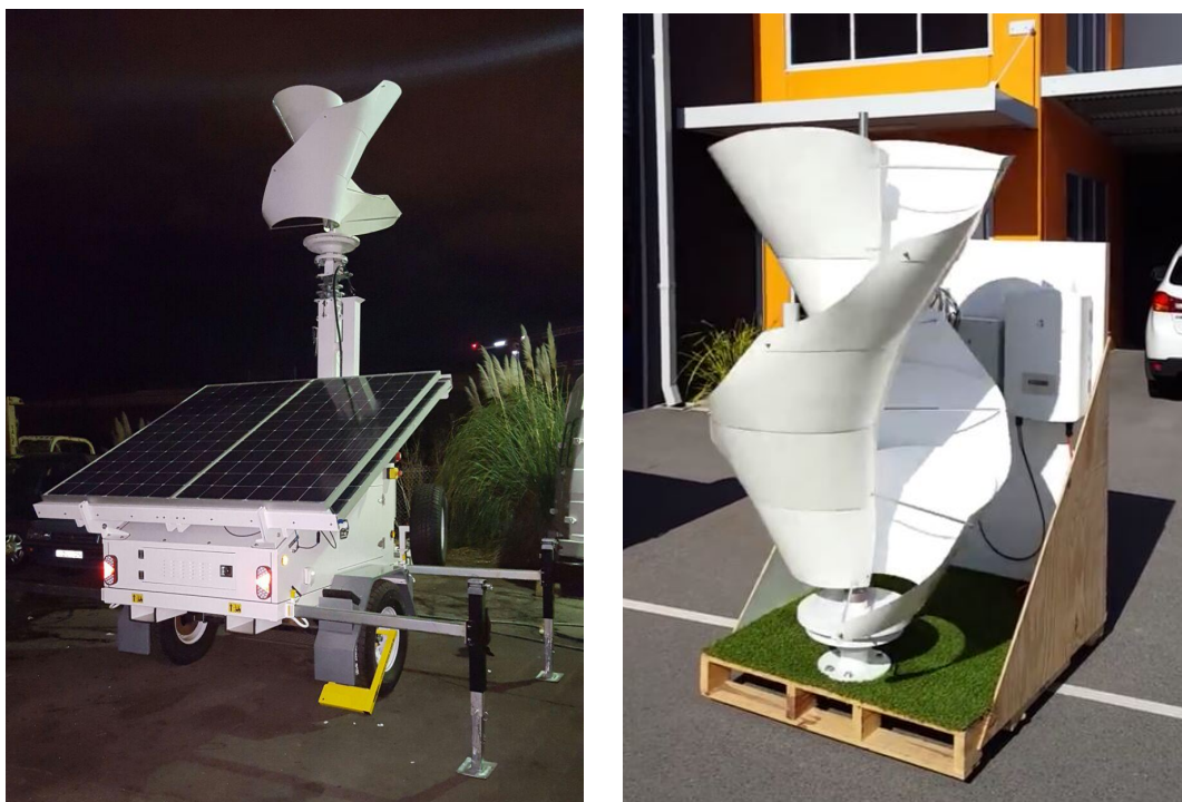
Figure 2: WindTurbine's HelicV6 product

Importantly, WindTurbine's products and systems are designed to operate successfully in low wind conditions and can work alongside solar systems, thereby providing consumers with a 24/7 renewable energy solution.