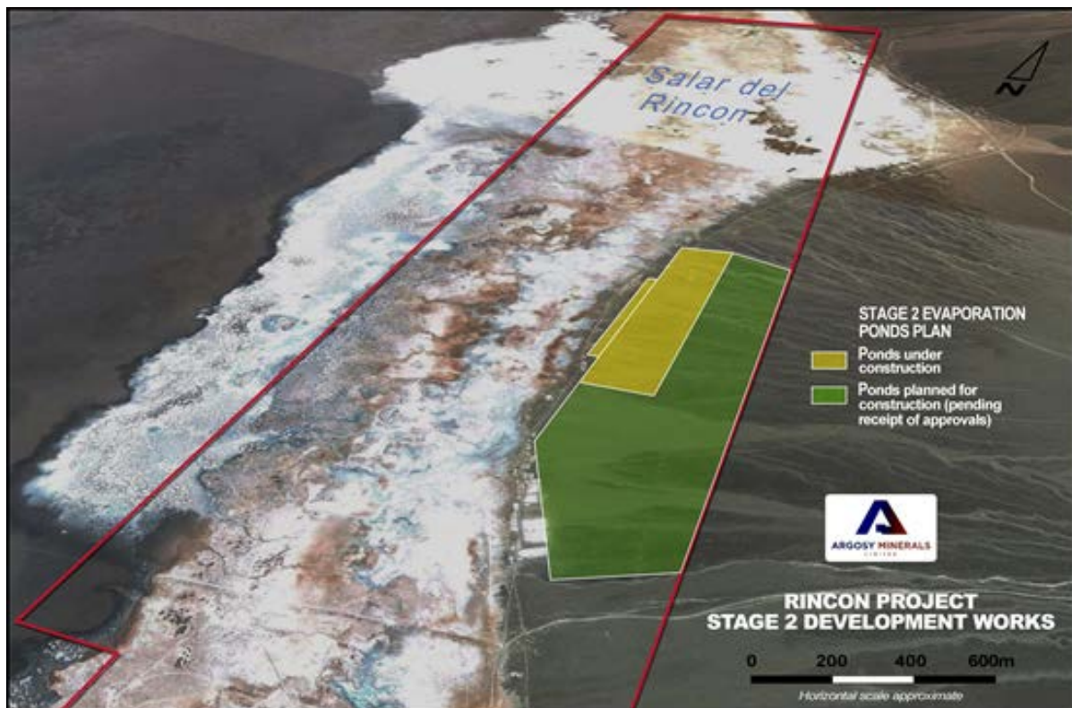
Figure 1. Rincon Lithium Project – Stage 2 Evaporation Ponds Plan.

Further additional ponds have been planned, and pending regulatory permits, are targeted for completion during October. This will result in a combined total of ~10 hectares of newly constructed lithium brine evaporation ponds (yellow shaded area in Figure 1 below).