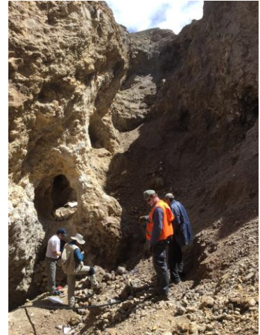
Figure 3: RIGHT The Torrepata mine working is the largest of the three workings at Cerro Rayas. It has numerous drives and stopes that provide access to a zone of mineralisation up to 5m in true width. Refer also to Figure 5. This will be subject of drilling within the soonest possible timeframe.

The purpose of underground mapping and sampling at Cerro Rayas' three mine workings is to determine the characteristics of mineralisation in preparation for project-wide exploration and fast-tracked drilling. While the Vilcapuquio-Torrepata-Wary zinc-trend is already well defined (as an exceptional 1.2km long drill target), better knowledge of it will help refine drilling parameters and enhance the discovery of possible parallel systems in the project.