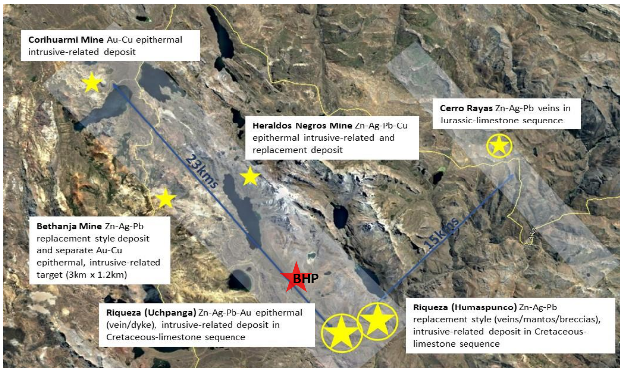
Figure 4: ABOVE A regional plan showing the location of Riqueza and Cerro Rayas in relation to mines in the vicinity, the Corihuarmi Au-Cu Mine, the Bethanja Zn-Ag-Pb Mine, the Heraldos Negros Zn-Ag-Pb-Cu Mine.

The Company has secured community support for exploration at Cerro Rayas and an Inca geological team is currently on site. The workings will be mapped at circa 1:500 scale and mine surfaces will be subject to detailed channel sampling. The mapping and sampling is expected to take three weeks to complete, with a further three - four weeks for assay results.