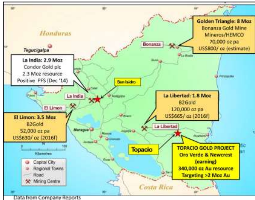
Figure 2 Major Nicaraguan gold deposits and the Topacio Gold Project