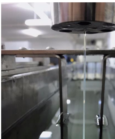
Photo of Fiber Production in the new factory

It will also be possible to manufacture other types of hollow fiber membranes at the new manufacturing site.