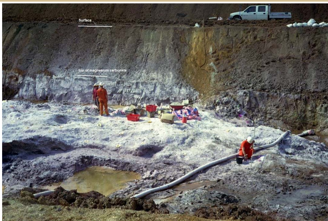
Figure 3 Test mining of magnesium carbonate rock using drill-blasting.

Mt. Elephant (Ashburton, WA) Au, Cu (Optioned for sale)