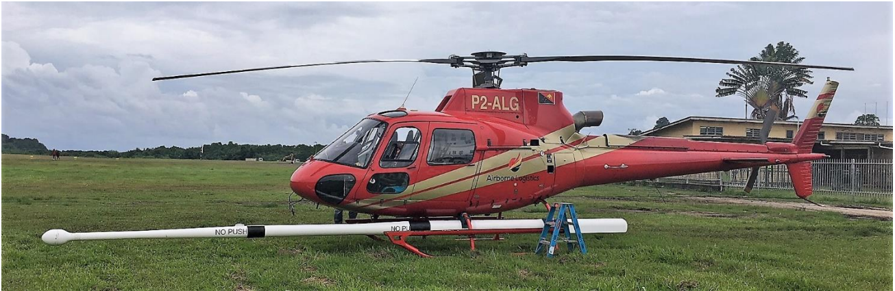
Airborne Logistics helicopter with Thomson probe at Buka Airport

Weather permitting, the data collection will be completed in September 2018 and the geophysical analysis reports are expected by mid-October 2018.