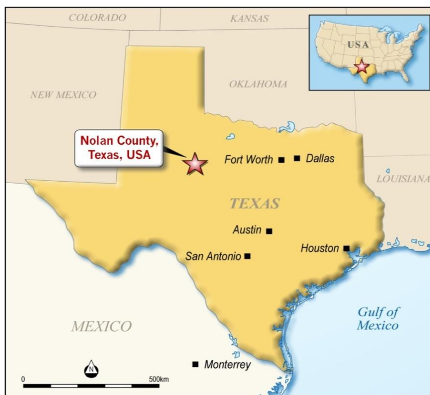
Location of the Company's acreage position in Nolan and Coke County, Texas, USA

* Please note that all oil and gas production is subject to royalty payments to the oil and gas rights owners. The figures represented above are for oil production only (and exclude gas sales) and are pre-royalty.