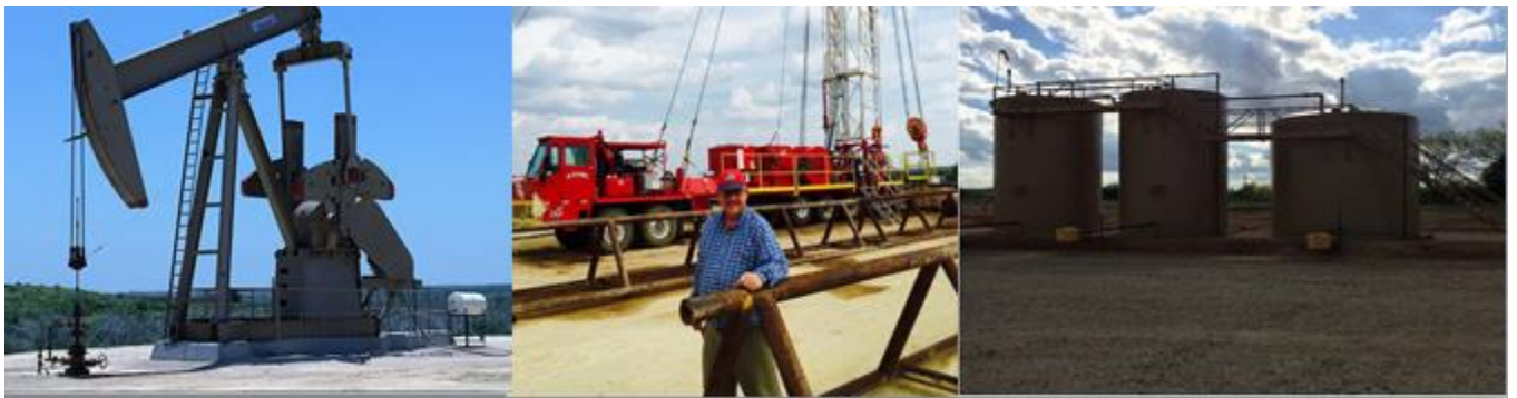
Winchester Energy field production & operations area, Permian Basin, Nolan County, West Texas