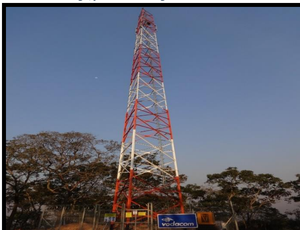
3G phone tower