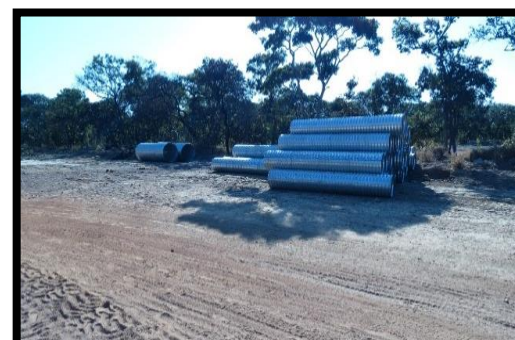
Assembled road culverts