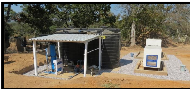
New water storage/filtration and gensets