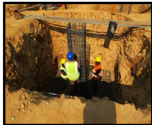
3G phone tower footings