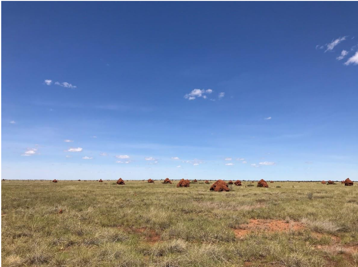
Figure 2. Flat topography with minimal areas of outcrop at the Euro Project.