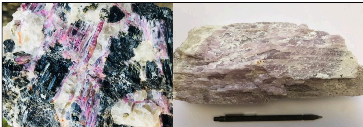
Figure 4: Samples from Tsarafara Prospect (spodumene-bearing pegmatite)