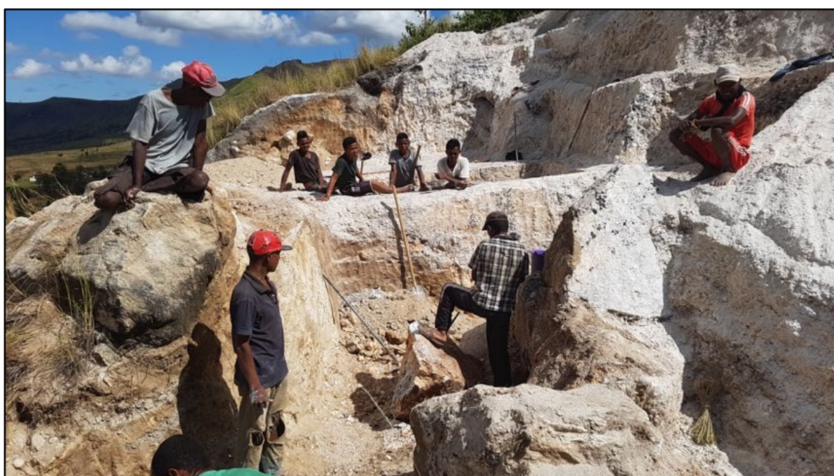
Figure 3: Sample collection at Tsarafara Prospect (spodumene-bearing pegmatite)