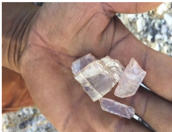
High purity Spodumene crystals discovered at Millie's Reward

Adjacent to the project area is the Holcim Talc Mine, which has a sealed road for product transport and grid power installed. In addition to the potential access of this infrastructure, Millie's Reward has extensive water supplies, accommodation and an available local workforce.