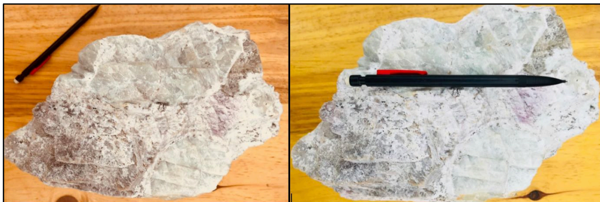
Figure 2: Samples from Ampatsikahitra Prospect (spodumene-bearing pegmatite)