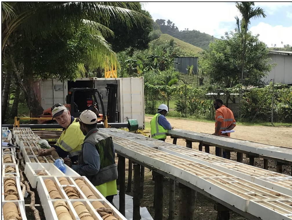
Figure 4: Core yard