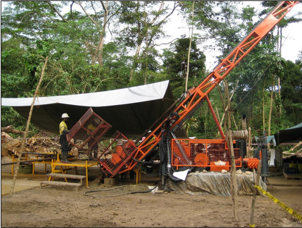
Figure 3: Drilling at Kulumalia North.