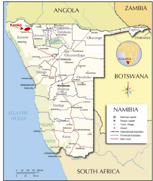
Figure 1: Location of the Kaoko Kobalt Project

The Kaoko Kobalt project is situated immediately to the north of, and abuts, Celsius Resources Limited's ("Celsius") (ASX:CLA) Opuwo Cobalt project. Celsius recently announced a maiden resource for the project of 112Mt @ 0.11% Co & 0.41% Cu (CLA ASX release 16 April, 2018). The Kaoko project has only had cursory exploration in the past, the results of which highlighted widespread base metal mineralisation. Aside from having the potential of ~80km of prospective DOF a previous regional 1km by 1km soils programme delineated a 20km by 5km area of subdued magnetics coincident with anomalous Cu-Co-Zn-Mn at the Kamwe prospect.