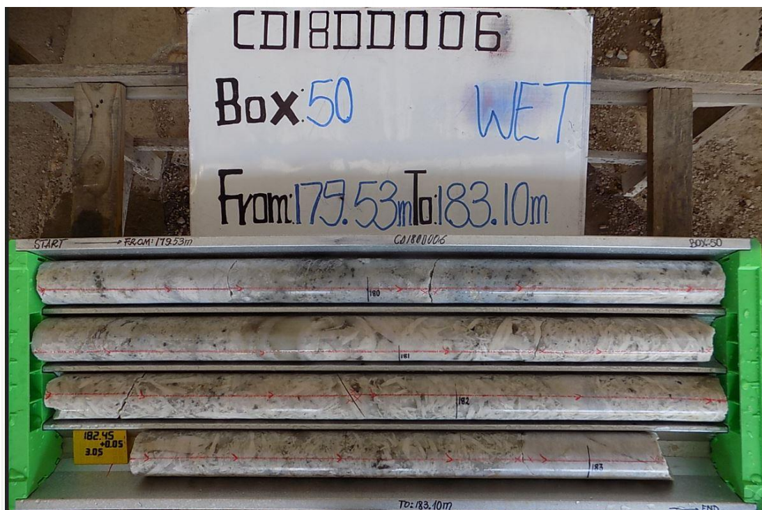
Figure 2: CDI8DD006. 181 – 182m 4.65% contained \text{Li}_2\text{O}