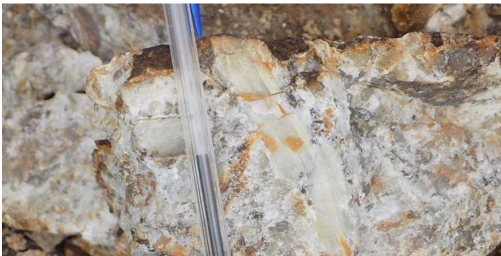
Figure 4: Rock Chip Sample collected showing white spodumene (the large, long prism to right of the blue pen) in a quartz feldspar matrix

The mean concentrations of deleterious elements are low with 0.1% F, 0.3% P_2O_5 and 0.4% Fe_2O_3 and should allow the Manono concentrate to trade at a premium to other products on the market.