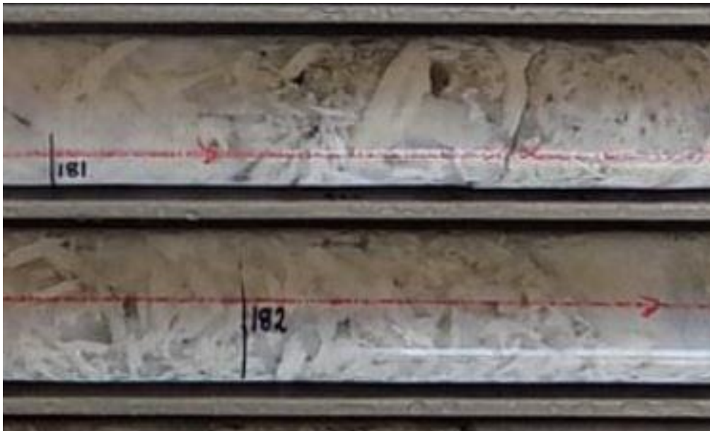
Figure 3: Close up of core from 181 to 182 metres. Very coarse spodumene throughout

Results confirm continuity of the Carriere de l'Estre pegmatite under alluvial cover and shallow dipping high grade intersections present within wider zones of well mineralised spodumene pegmatite.