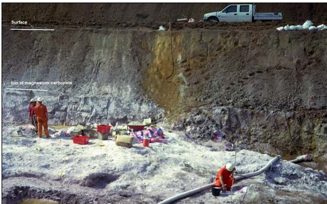
Figure 3 Test mining of magnesium carbonate at Winchester (setting of explosive charges)

Mt. Elephant (Ashburton, WA) Au, Cu (Optioned for sale)