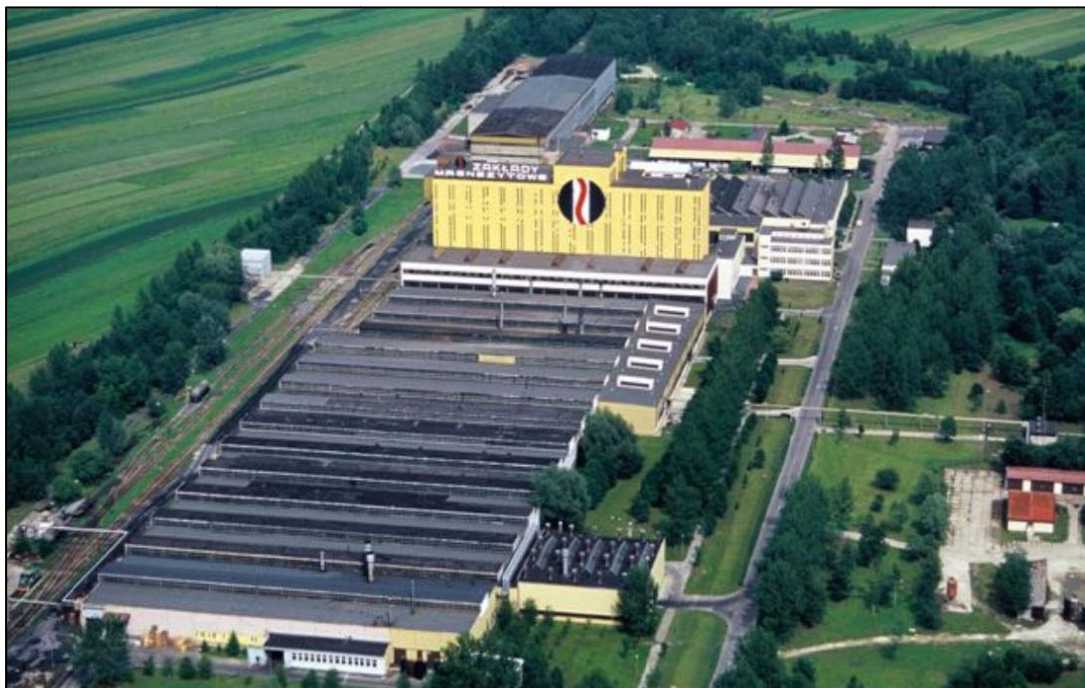
Figure 1 ZM Ropczyce SA operations at Ropczyce, Poland 2

Further updates regarding the Winchester magnesium carbonate project will be provided to the market as and when required.