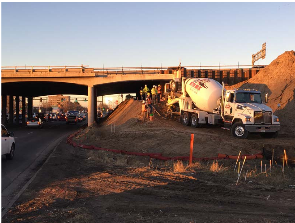
Figure 2. EdenCrete® shotcrete mix being supplied to the CDOT Project

The EdenCrete® shotcrete mix was used to stabilize a buttress wall under an I-70 bridge (see Figure 2), and performed very well. The project is estimated to require 6,000-10,000 cu/yards of shotcrete. EdenCrete® is currently being added at 0.5 gallons/ cu. yard of concrete.