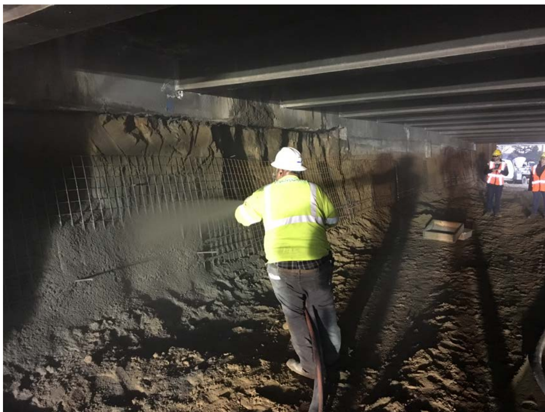
Figure 1. EdenCrete® shotcrete concrete mix being applied

As referred to above, following approval by the Colorado Department of Transportation ("CDOT") for EdenCrete® to be used in a shotcrete concrete mix, during the quarter EdenCrete® was used for the first time on the CDOT Central 70 project in Denver (see Figure 1).