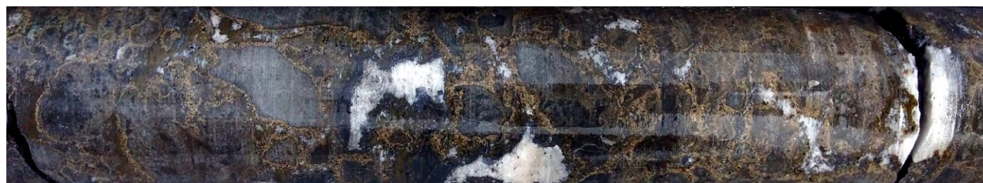
Figure 3: Diamond core from AF013, 124.0m. Example of abundant sphalerite (pale brown) in matrix of dolomite breccia occurs over 4 metres