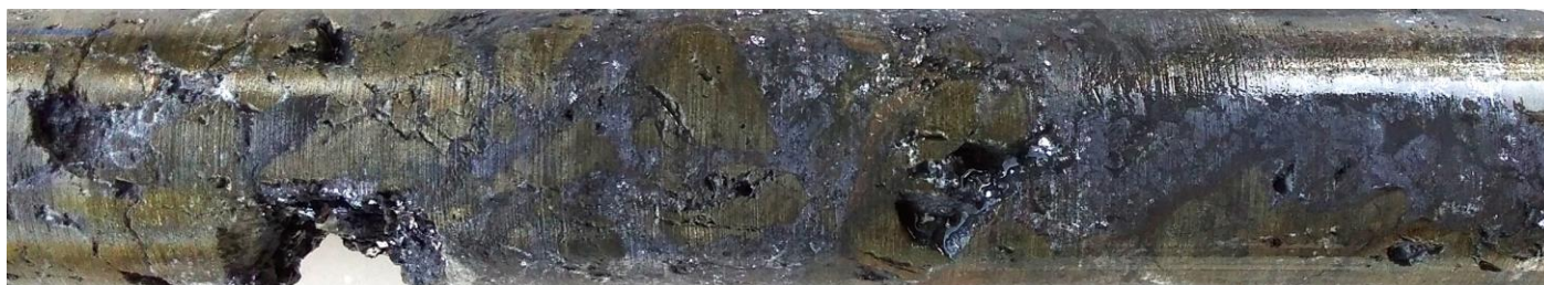
Figure 2: Massive sulphides – Typical galena (grey-blue) with pyrite (bronze colour), diamond core from AF005, 82.1m. Strong lead mineralisation is intersected over 9.4m length in this particular hole.