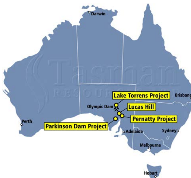
Figure 2: Location of Tasman Project Areas in South Australia