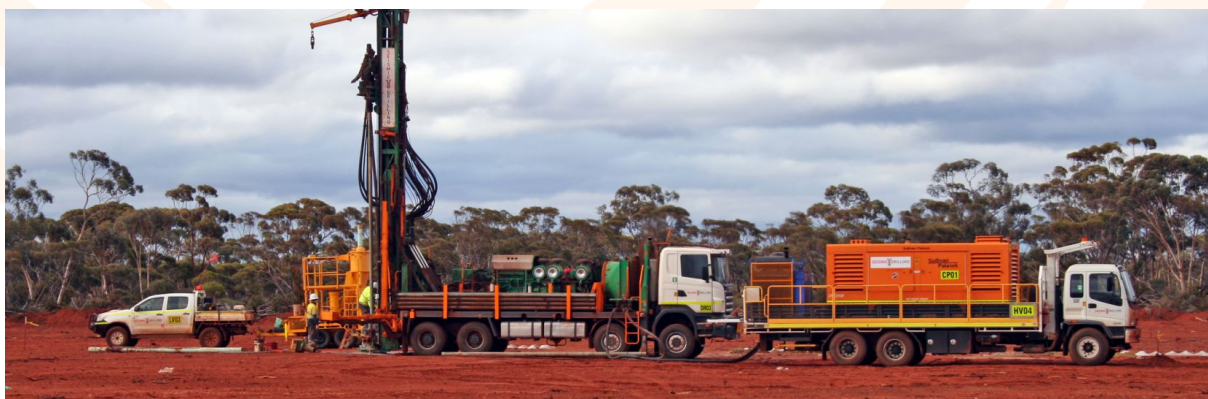
Figure 2: Grade control drill rig.

Additional holes intersected the upper portion of the deeper, saprolite ore beneath the supergene zone confirming the upper geometry and high grades. Fourteen significant intersections of the saprolite zone returned above 4g/t Au.