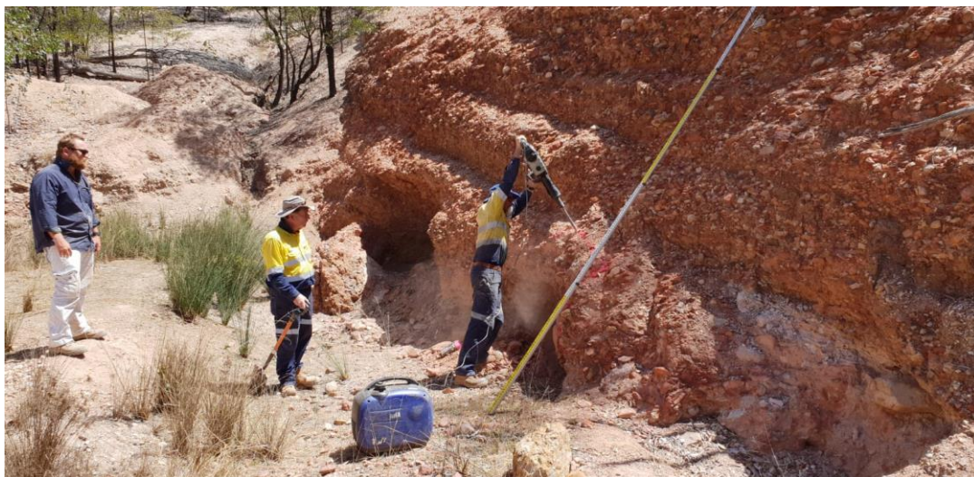
Figure 1. Outcrop of free-digging conglomerate. Unconformity at base of cliff.

The samples have been collected at or near the gold-bearing contact (unconformity) between an upper younger unit of Permian conglomerates and a lower unit of schist, part of the older Anakie Metamorphic Group (Figure 1).