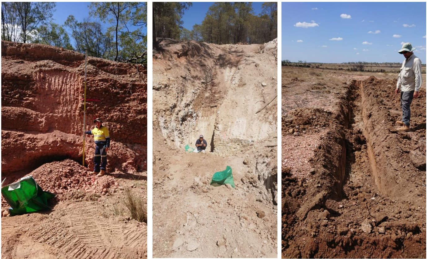
Figure 2. Examples of Sample Sites at Blackridge including samples taken from previous workings.

Work by companies such as Novo Resources Corporation in the emerging conglomerate-hosted gold province of the Pilbara region of Western Australia, has shown that very large samples may need to be processed in order to overcome the significant "nugget effect" that is a major factor in the exploration for this style of deposit. Impact has shown that the nugget effect was an important factor in previous exploration drilling at Blackridge (ASX Release May 29 th 2018).