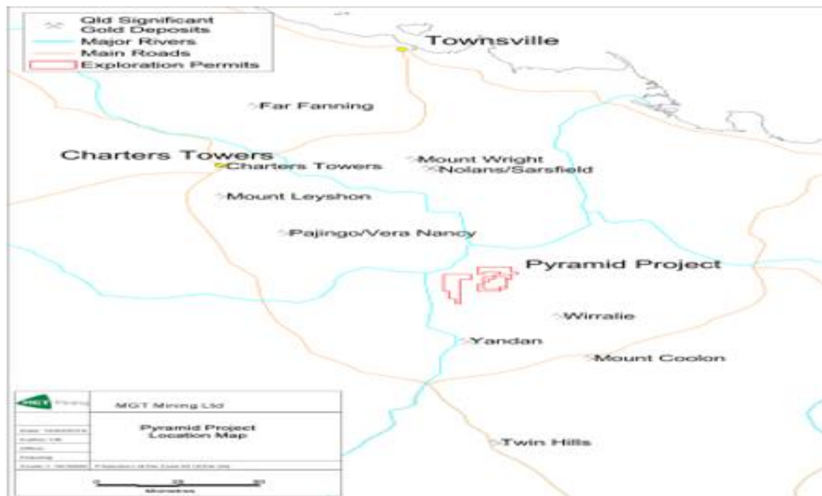
Figure 2. Location of the Pyramid Project in North East Queensland.

Pyramid Gold Project, Queensland - The Company has now completed a follow-up geochemical exploration program on its exploration assets located in the East Pyramid Range in North Eastern Queensland.