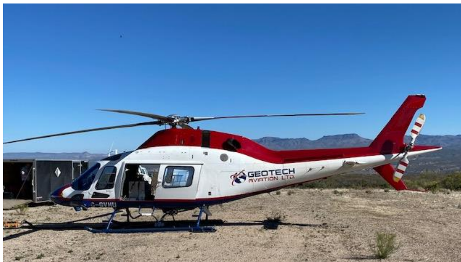
Recently Completed VTEM+ Geophysical Survey at Oracle Ridge

Current exploration activities at Oracle Ridge are focusing on defining extensions to the known Resources and the recently completed airborne VTEM geological survey will assist with this workstream. Future planned work for 2020 includes defining a robust JORC model to support future mining studies and the definition of exploration targets for future drilling programs.