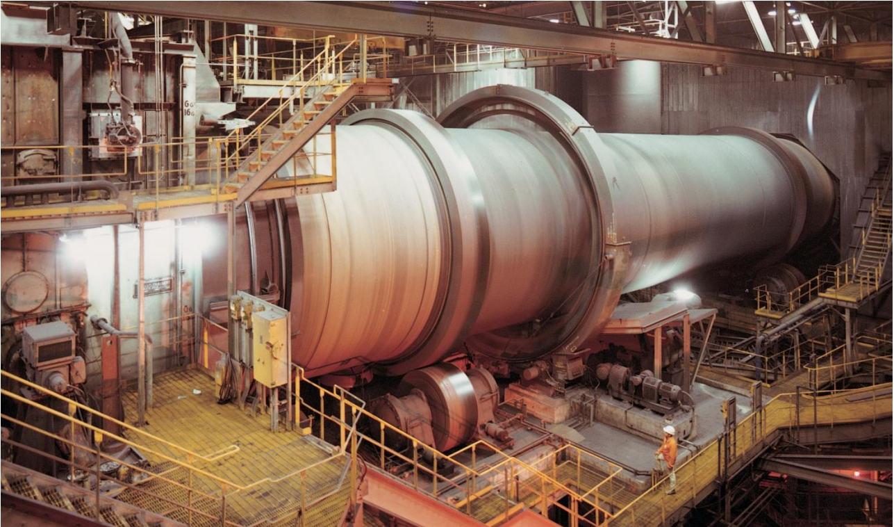
Figure 4: Commercial Metso Grate Kiln

For the Grate Kiln vanadium process, the rotary kiln is still the heart of the procedure. This reduces the risk of building a completely new processing scheme. The Grate Kiln process utilises the rotary kiln as the final roasting process but is enhanced by incorporating pelletising, a travelling grate and a packed bed cooler. Collectively this system enables higher vanadium recovery, lower energy costs and reduced process risks using a proven technology.