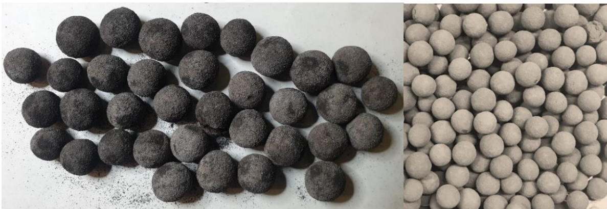
Figure 2: Vanadium Rich Iron Concentrate Pellets Produced During Bench-scale Roast Testing

AVL's bench-scale pelletising testwork demonstrated that vanadium roast leach extractions rose to an average of 92%, compared with a traditional rotary kiln extraction of 85-88%. Vanadium roast extraction in the AVL PFS was 87.9% 2 . Figure 2 shows the vanadium rich iron concentrate pellets that were produced during bench-scale roast testing in 2019.