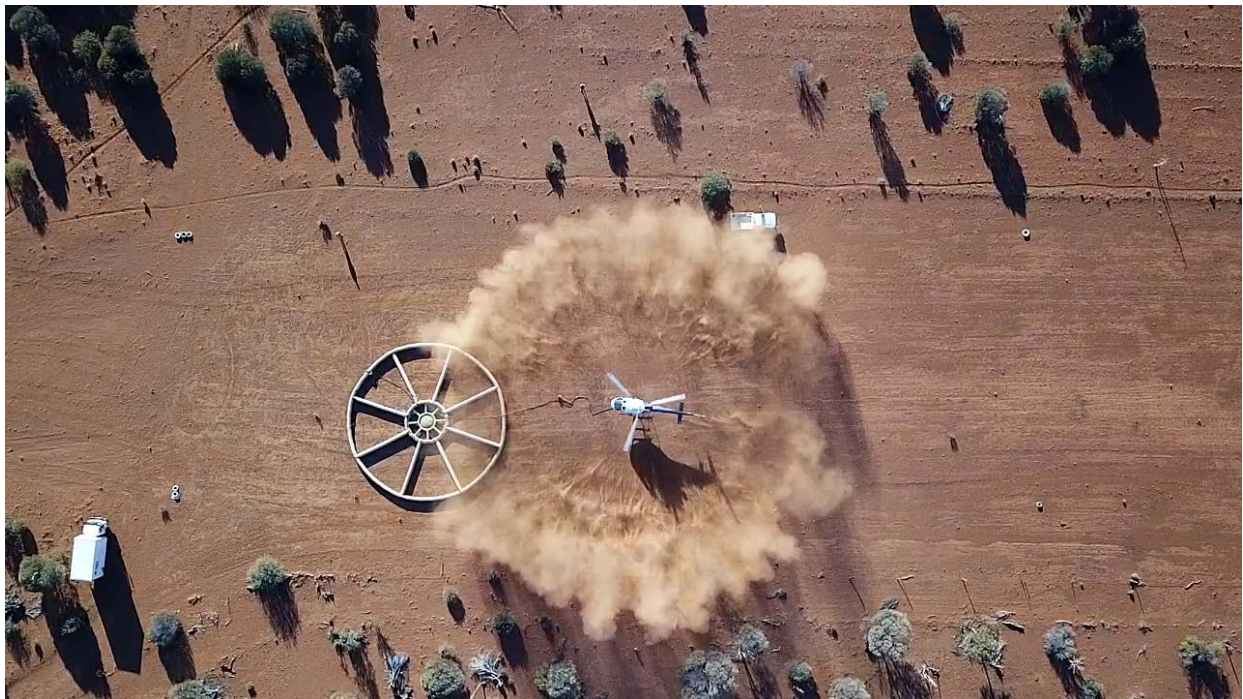
NRG Helicopter - Time domain EM survey data capture Bottle Creek 2019

Challenge Drilling are scheduled to commence an additional 2,500 metres of RC drilling mid November 2019, drilling additional infill resource drilling. The Company expects to deliver a resource upgrade in Q1 2020.