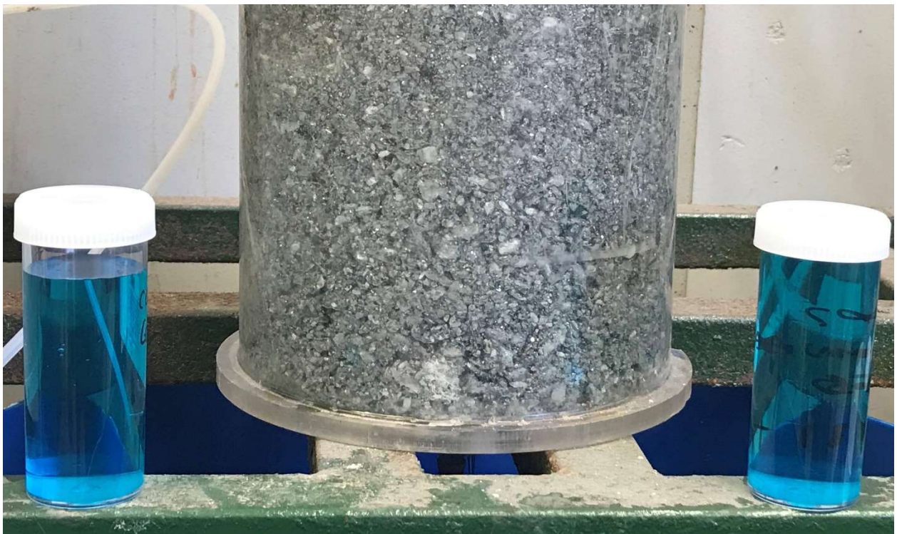
Image 1 / Metallurgical column test-work

Further updates will be provided as the metallurgical test-work progresses.