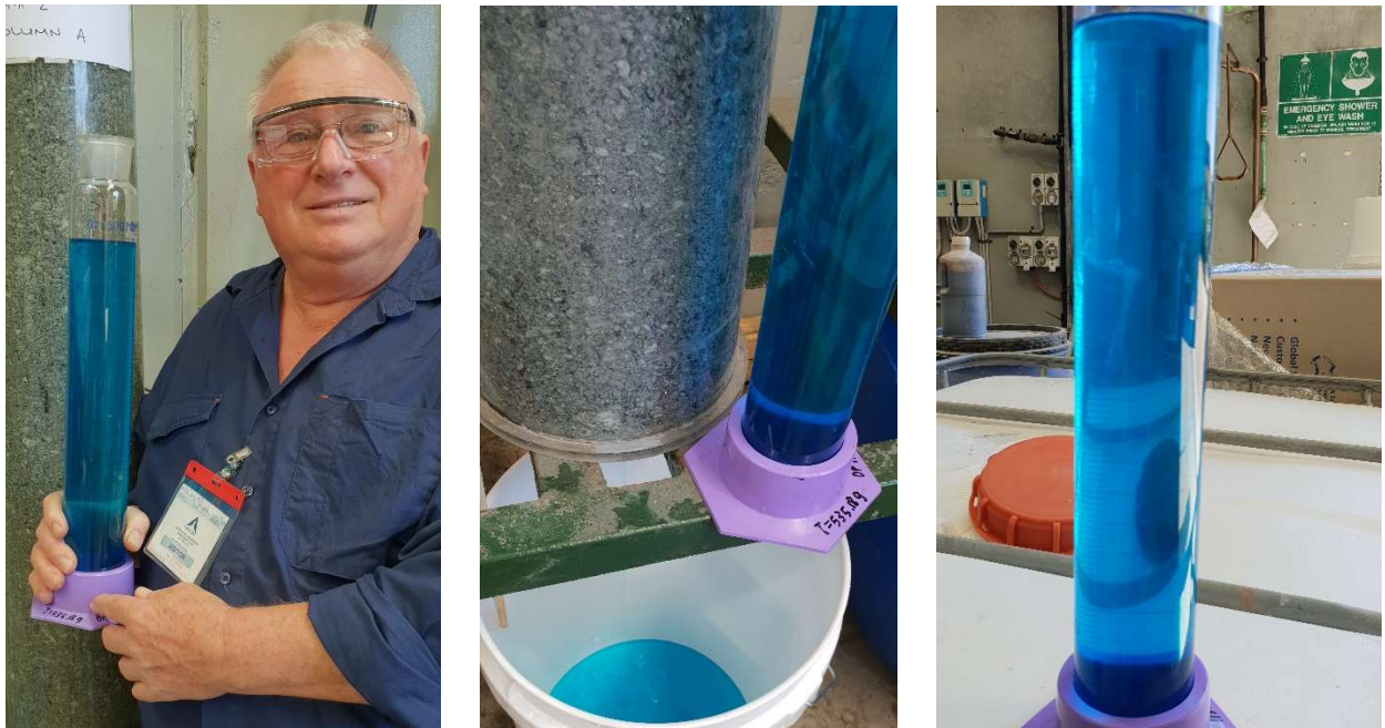
Images 2 - 4 / Metallurgical column test-work

The metallurgical diamond drilling programme (refer to CYM ASX announcement dated 14 October 2019) consisted of three holes for 320m into the mineralised envelope of the Hollandaire Prospect at the Cue Copper Project to provide representative samples for test-work to be undertaken as illustrated in Figure 1.