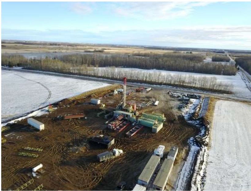
Figure 2- Rex-3 Drilling

Drilling operations are expected to be finished early next week.