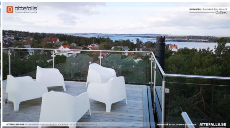
Attefalls® Epic Wave 3 Custom built 2016, Frölunda Sweden