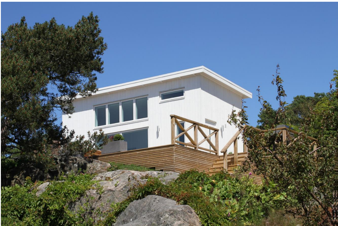
Attefalls® 25kvadrat Liv built 2015, Särö Sweden