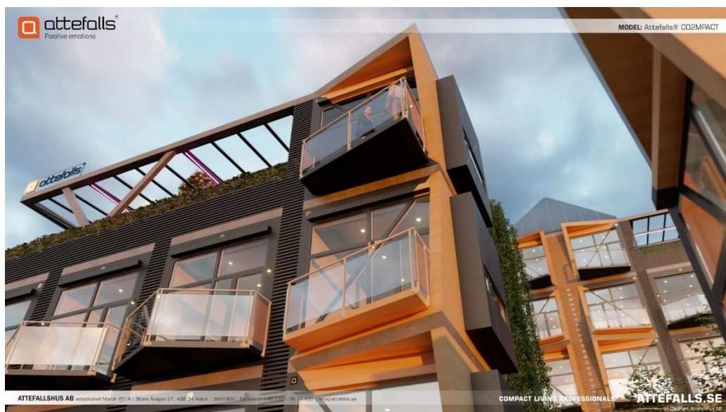
Attefalls® new module CO2MPACT. Presented at the Bostongreenfest event. https://youtu.be/2uRvOGzoyck