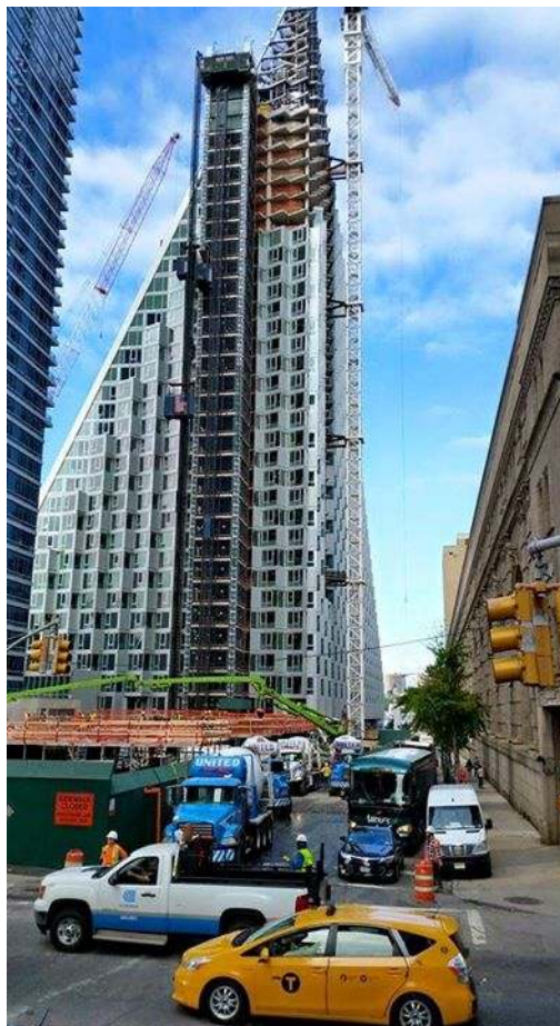
Figure 1. United Transit concrete being supplied to a construction project in New York

United Transit, a ready-mix concrete supplier that has been operating since 2002, services the greater New York City market, supplying concrete to a range of customers for use in a variety of applications, that frequently include low to mid-rise building construction (see Figures 1 and 2).