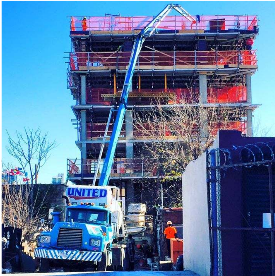
Figure 2. United Transit concrete being supplied to a construction project in New York

The installation of a bulk, storage tank and dispensing system, and the accompanying first commercial order, for EdenCrete®Pz from a New York based ready-mix company for inclusion in a standard concrete mix, represent a major breakthrough into the very large New York concrete market, that follows the successful completion of more than two and a half years of testing and development of EdenCrete®Pz for use in the regional concrete mixes in the New York area, and an extended period of testing and certification of EdenCrete®Pz by United Transit.