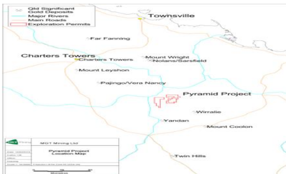
Figure 1. Location of the Pyramid Project in North East Queensland.

The topography of the EPC 12887 is dominated by the West Pyramid Range and the parallel East Pyramid Range. The West Pyramid Range contains a plus 6km mineralized structure which extends from the Gettysberg and Sellheim prospects in the NNE to the Marrakesh and Pradesh prospects to the SSE. Gold and base metal mineralization, as defined by geological prospecting and surface sampling, occurs along the extent of this structure. The East Pyramid Range is characterized by Late Carboniferous to Permian age intrusive related hydrothermal systems, which are associated with prominent bulk tonnage gold systems in North Queensland. Mt Leyshon, Ravenswood-Mt Wright and Kidston are multi-million ounce examples of this style of mineralization in North Queensland.