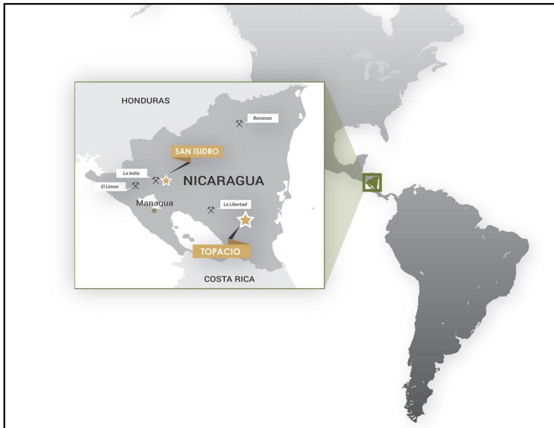
Figure 1 Location of Nicaragua and Oro Verde's Projects

The Company operates the San Isidro mineral concessions in Nicaragua and has three exploration licences under application near the Topacio project (Figure 1).