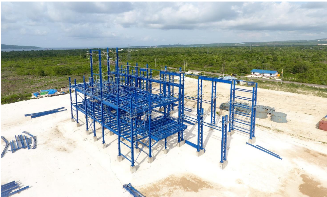
Figure 1: Kupang Smelter Hub Construction Site

During the year in focus, the Company made the decision to scale back construction activities while extra emphasis was placed on securing the requisite funding to finish construction. In addition, the Company has also ramped up its efforts to lock away diversified supply channels of high-grade ore to underpin future production.