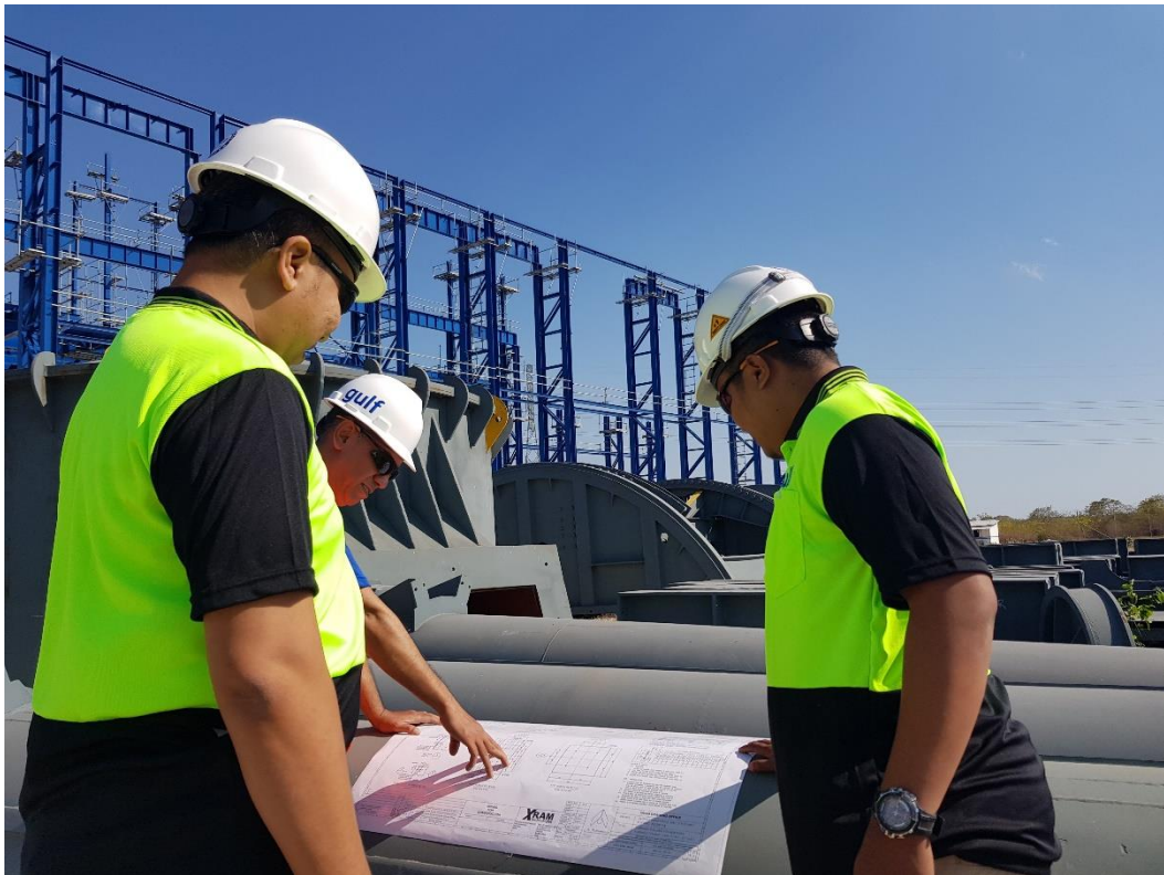
Figure 2: Smelters and Construction Site – Kupang Smelting Hub at Bolok Industrial Estate