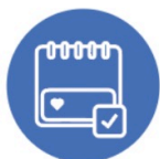
Pregnancy management tools