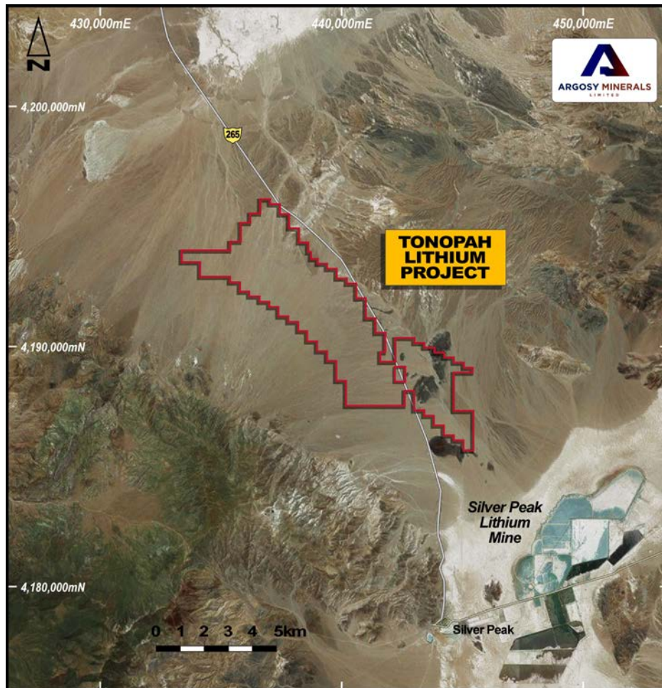
Figure 1. Location of the Tonopah Lithium Project (relative to Silver Peak Lithium Mine)

The Company considers the opportunity to develop a USA based project in a jurisdiction supportive of the commercial development of lithium, and which is listed on the US Government's 2018 Final List of 35 Minerals Deemed Critical to U.S. National Security and the Economy, as a strategic position to further develop Argosy into a world-class lithium producer. Furthermore, last month, the US Department of Commerce reported that "unprecedented action" would be taken to strengthen the USA's critical mineral supply chains, including via support for domestic resource development.