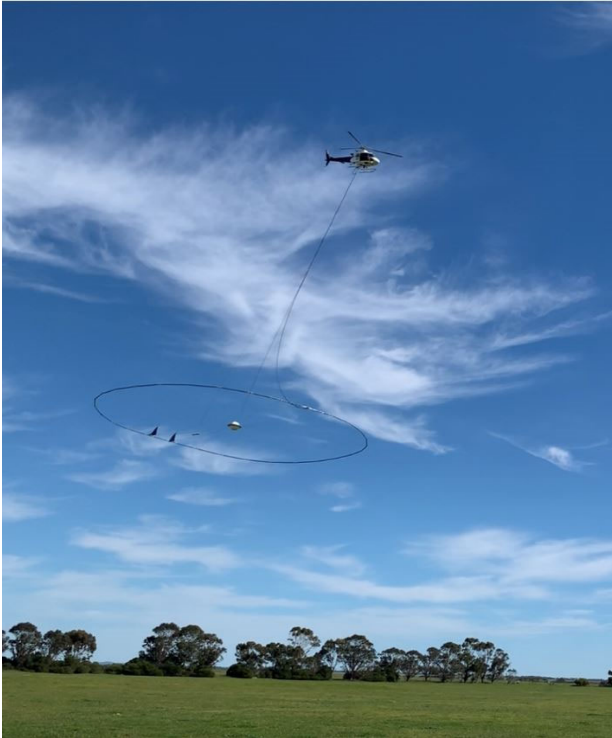
Figure 3: Moora Project: Photo of helicopter conducting AEM survey