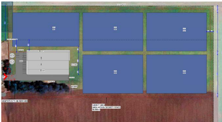
Figure 1: architects aerial view of stage 1

“We believe the power prices and cost of labour in Australia are in many cases restrictive to the business case of growing indoor long term, so we are adopting a practical approach whereby we are applying our skills in growing cannabis with a vision of where the industry is headed and how the industry is already evolving overseas.”