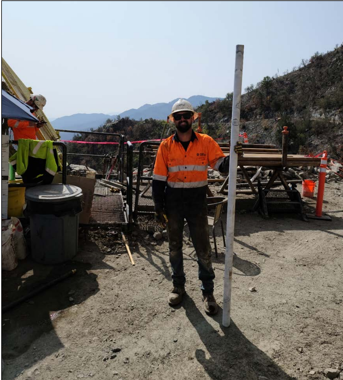
Figure 2 Happy driller: “Stick Rock” from drill hole WT-20-03.

that Eagle Mountain maintains their “A-Team” and this placement and early exercise of options will allow the Company to keep the drill rig and teams in place.