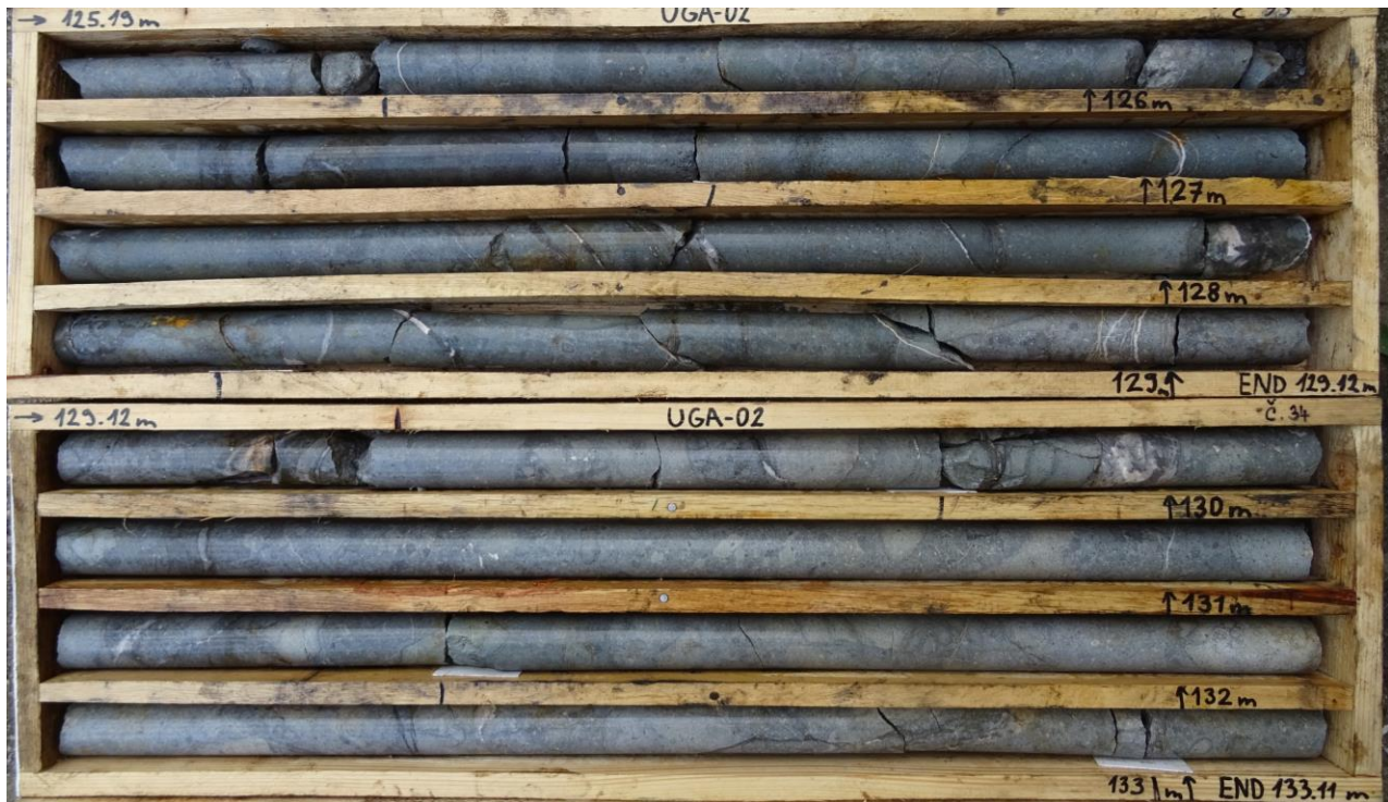
Figure 1 (cont.): Drill core photo from UGA-02 showing multiple fine-grained quartz veins, rich in fine grained sulphides (mainly pyrite) and hosted within strongly leached and argillic altered andesite host rock