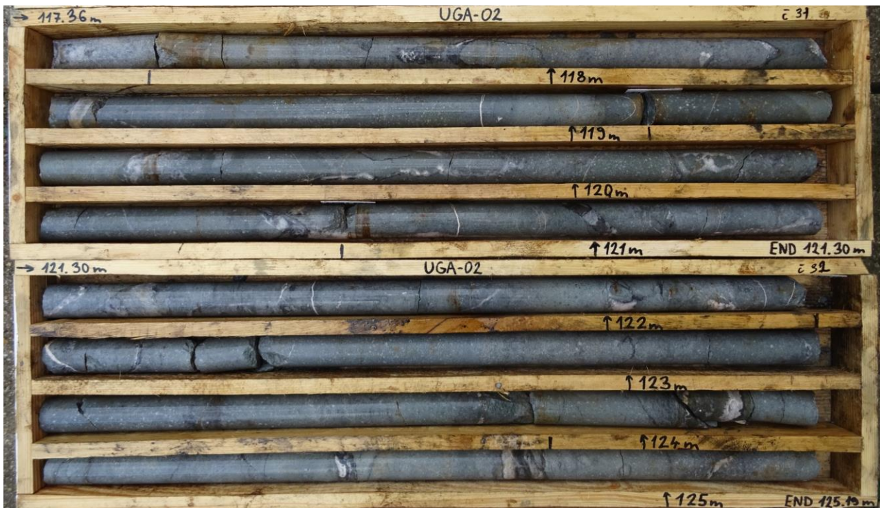
Figure 1: Drill core photo from UGA-02 showing multiple fine-grained quartz veins, rich in fine grained sulphides (mainly pyrite) and hosted within strongly leached and argillic altered andesite host rock

Opening access within the Andrej Adit will provide the Company with a low-cost opportunity to scale up the exploration at Sturec as the Company progresses towards the delineation of a potentially high-grade economic underground gold mine.