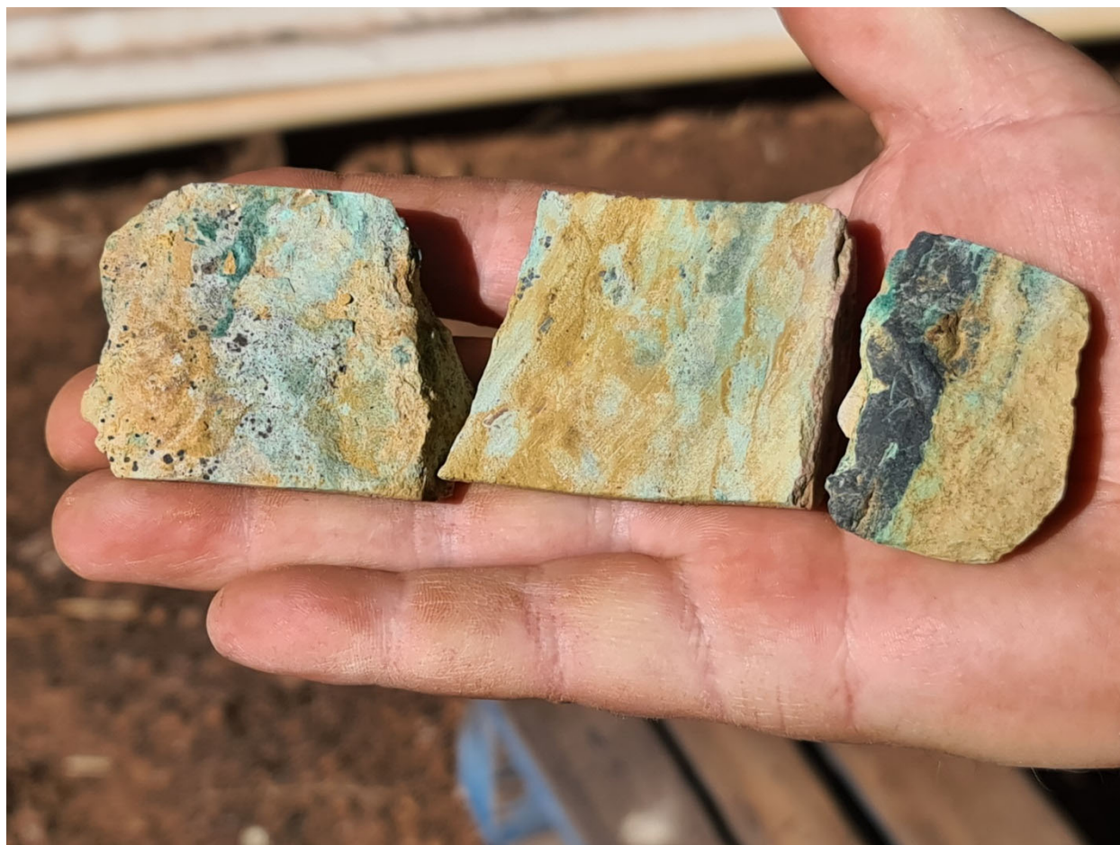
Figure 1: drill core showing the cross-cutting nature of the copper mineralisation

Rock chip sampling were collected during the field mapping exercise which was conducted across selected parts of the tenement and demonstrated that Cu, Pb and Zn anomalism could be much greater than initially considered. In addition, the historical drill core re-analyses confirmed that previous drilling over the Company's Redbank structure did intersect significant copper mineralisation. Reinterpretation of the available diamond drill core combined with field mapping, historical gravity and EM data indicate that the Redbank structure(s) may be mineralised over a strike length of 2.8 km.