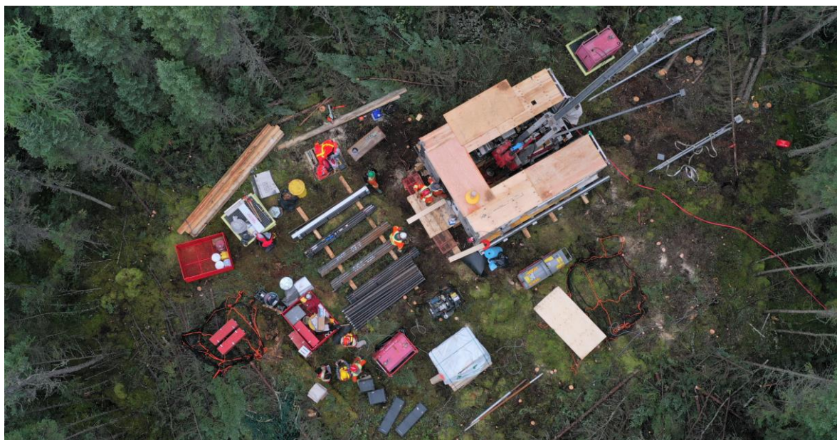
Figure2 – Major Drilling's Drilling Rig setup at the Kasagiminnis Gold Deposit