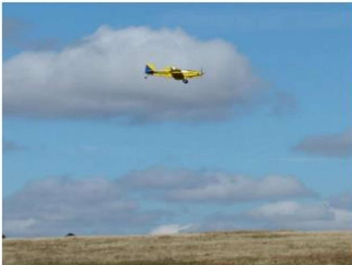
Figure 2 Amersfoort survey in progress April 2014