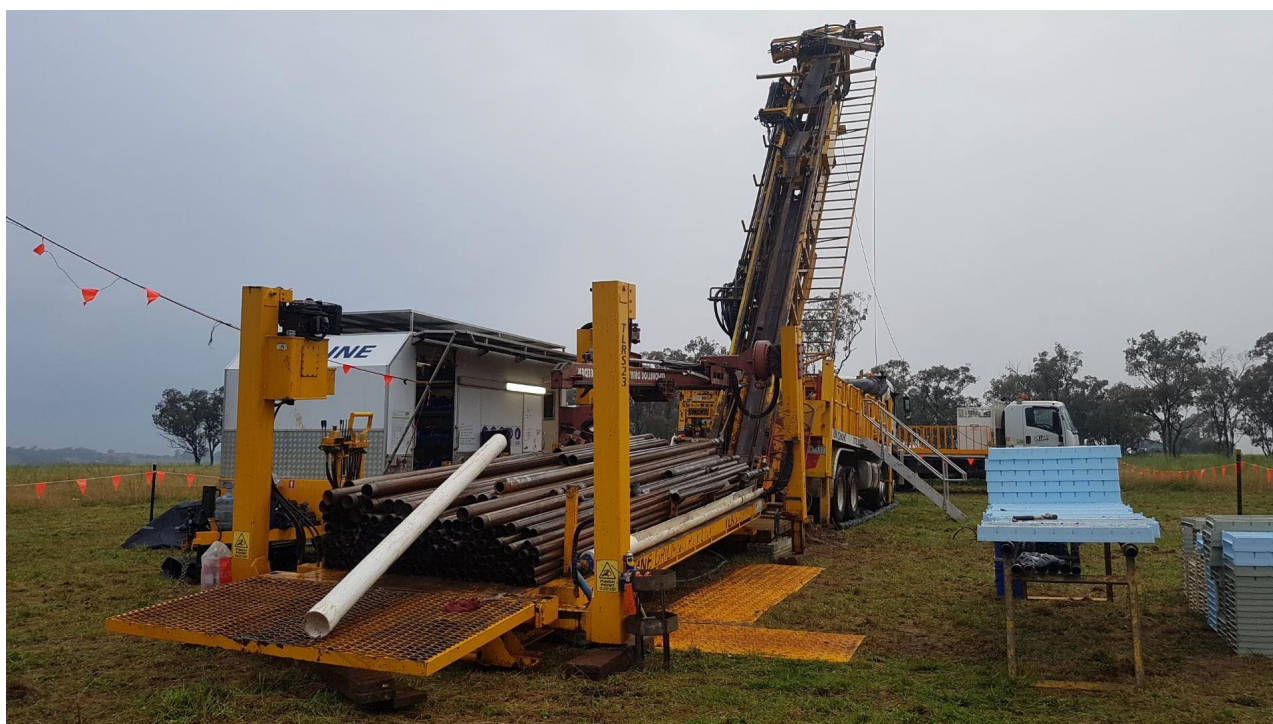
Figure 1. Drilling operations commencing at Boda East.