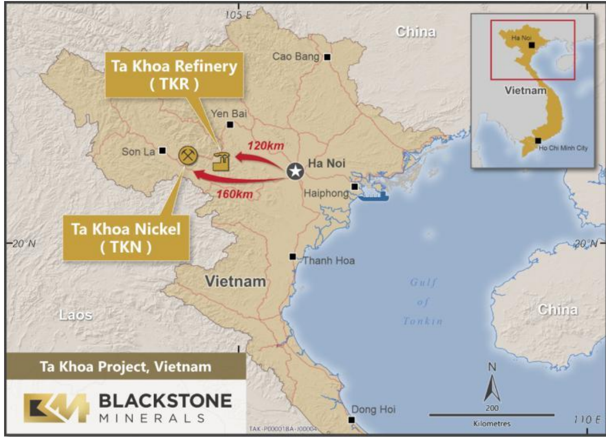
Figure 1: Ta Khoa Project Location