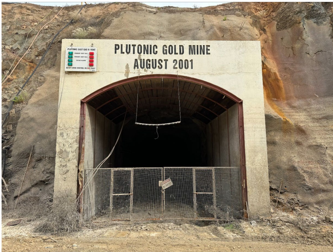
Figure 4: Plutonic East portal