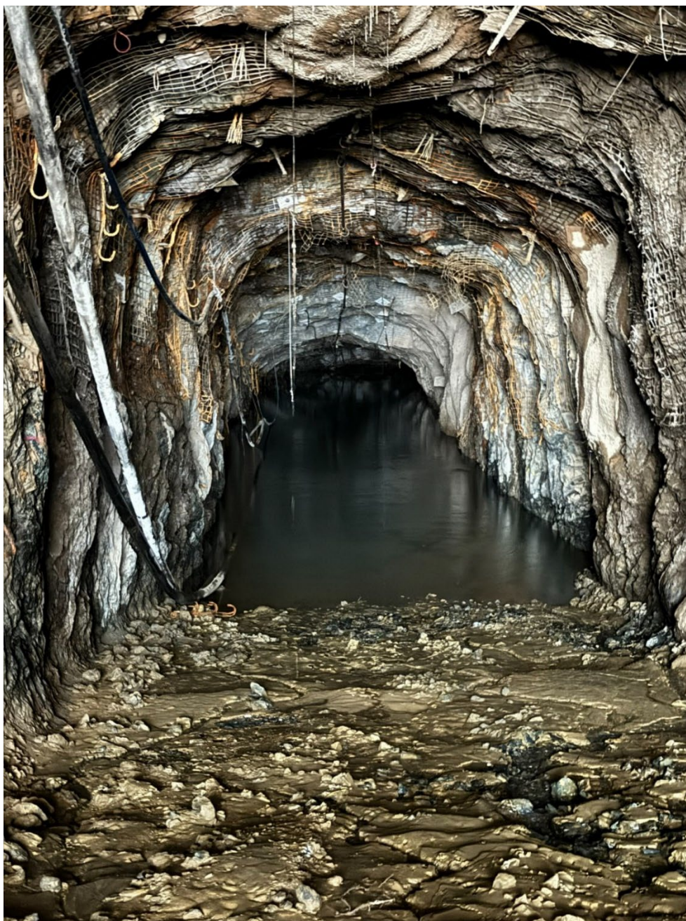
Figure 6: Plutonic East decline dewatering

This announcement has been approved for release by the Board of Directors of Catalyst Metals Limited.