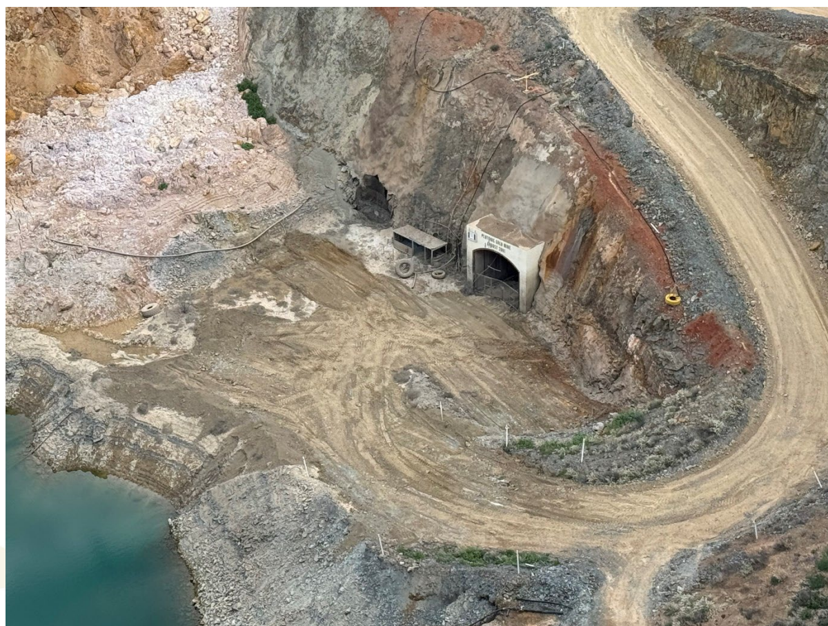
Figure 3: Plutonic East portal location at base of open pit showing refurbished access