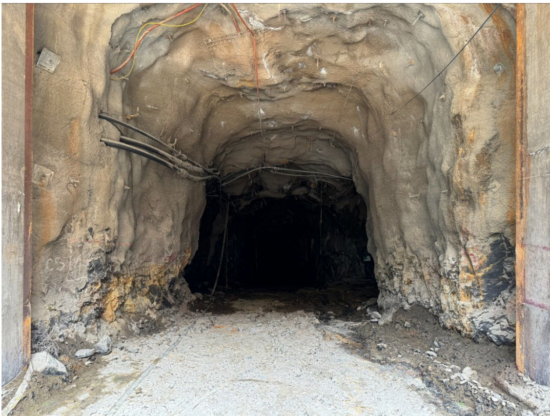
Figure 5: Plutonic East decline