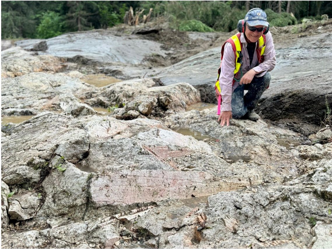
Figure 1: Metre-scale pink spodumene (kunzite) crystals exposed at the Tot Pegmatite (sample ID 347562, 347565, 347604, 347561 3 ).