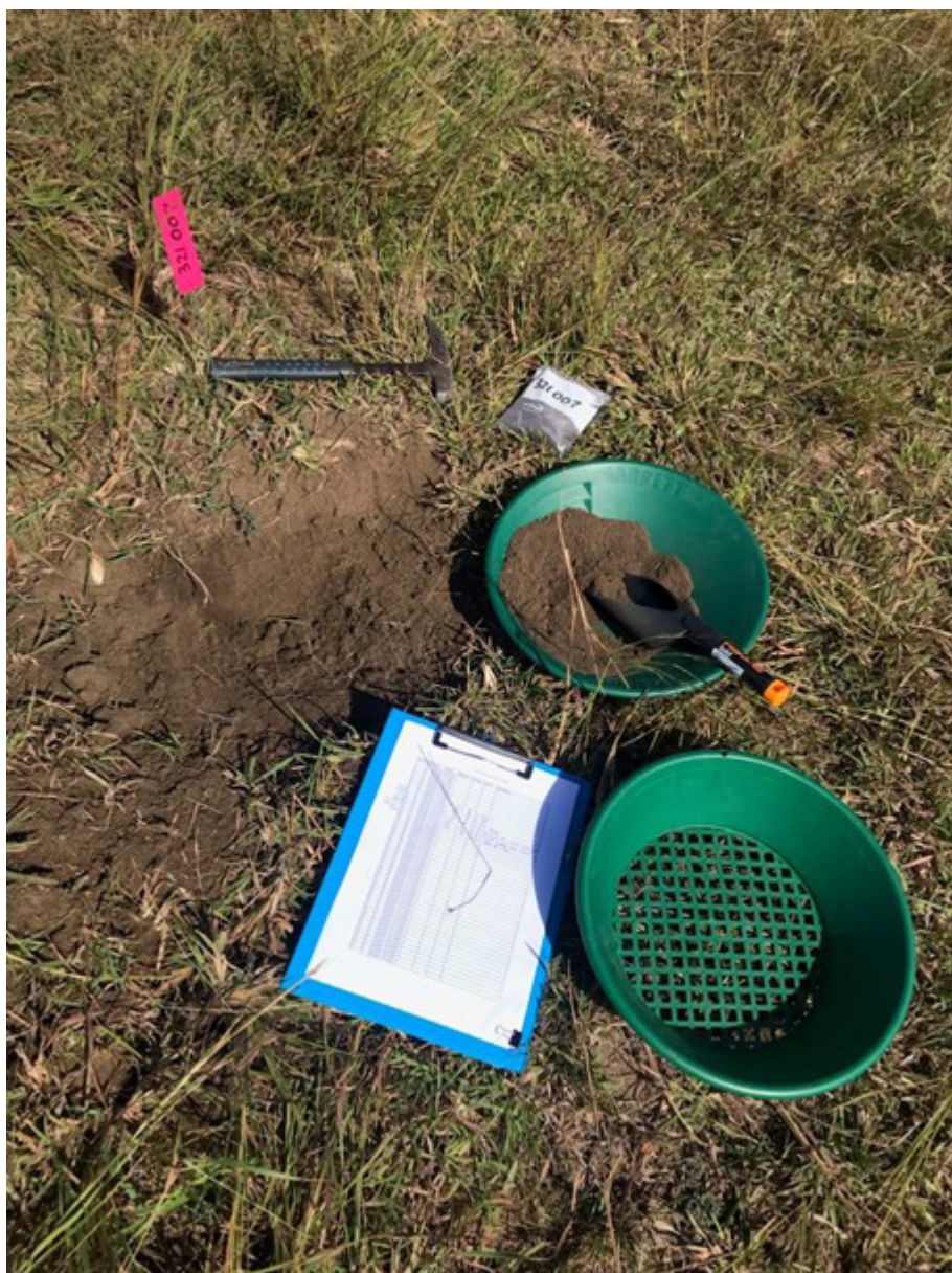
Soil sampling at Coonambula

We were fortunate to gain access to a newly identified potential southern extension to the Banshee area and collected 87 soil samples including an orientation line across the known Banshee mineralisation. Analyses and interpretation from the soil samples is expected in Q1FY25.