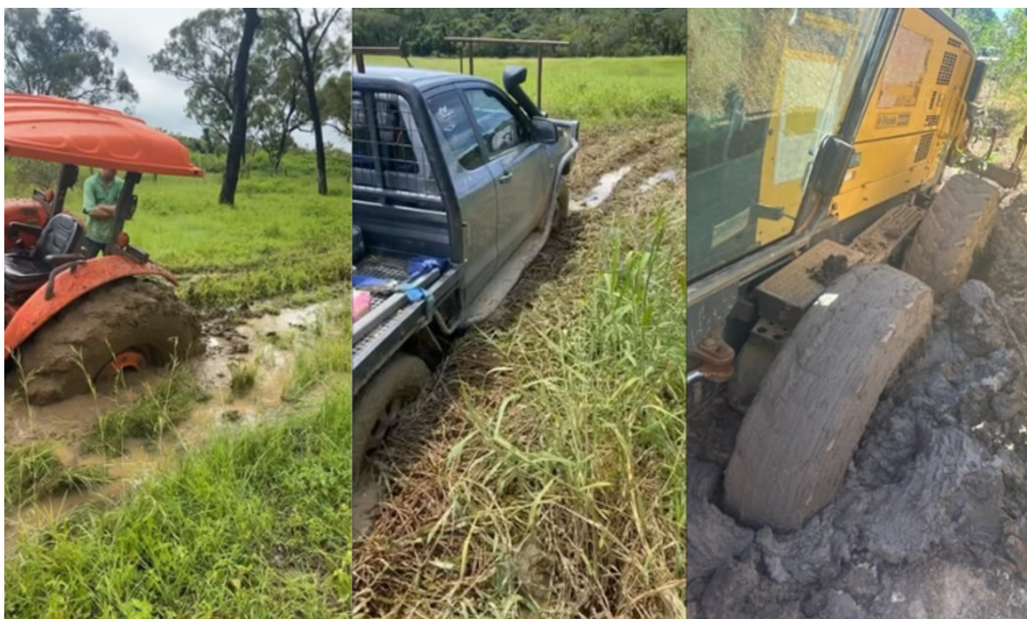
Above: Wet conditions in north Queensland June 2024

The Company is scheduled to complete these works during Q1FY25.