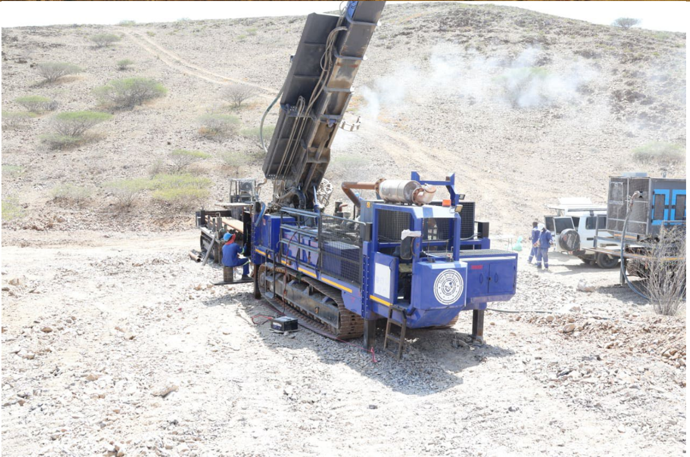
Figure 3: RC Drilling at Muvero.