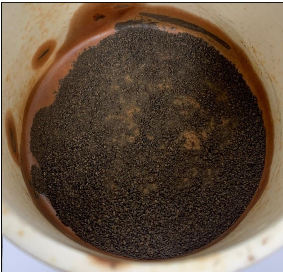
Figure 1; Vanadium Pentoxide flake produced from the Canegrass mineralisation.

"With this next step in the testwork we are seeking to extract the maximum value from the inherent value we have in the Project and looking to unlock it for the benefit of our shareholders."