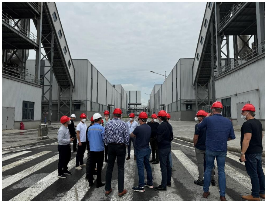
Image 5: Tour of Canmax Technologies Co., Ltd 60,000 tonne per annum lithium hydroxide plant in Meishan