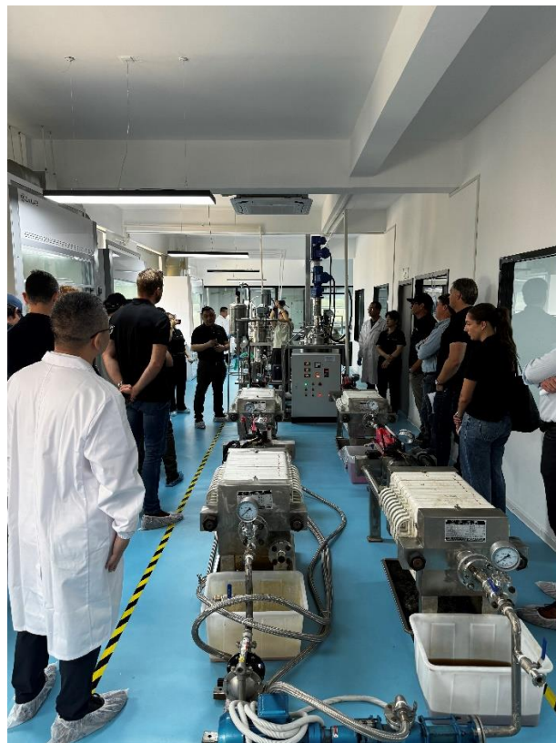
Image 4: Tour of Firebird's Pilot Plant and R&D Centre in Jinshi, Hunan Province