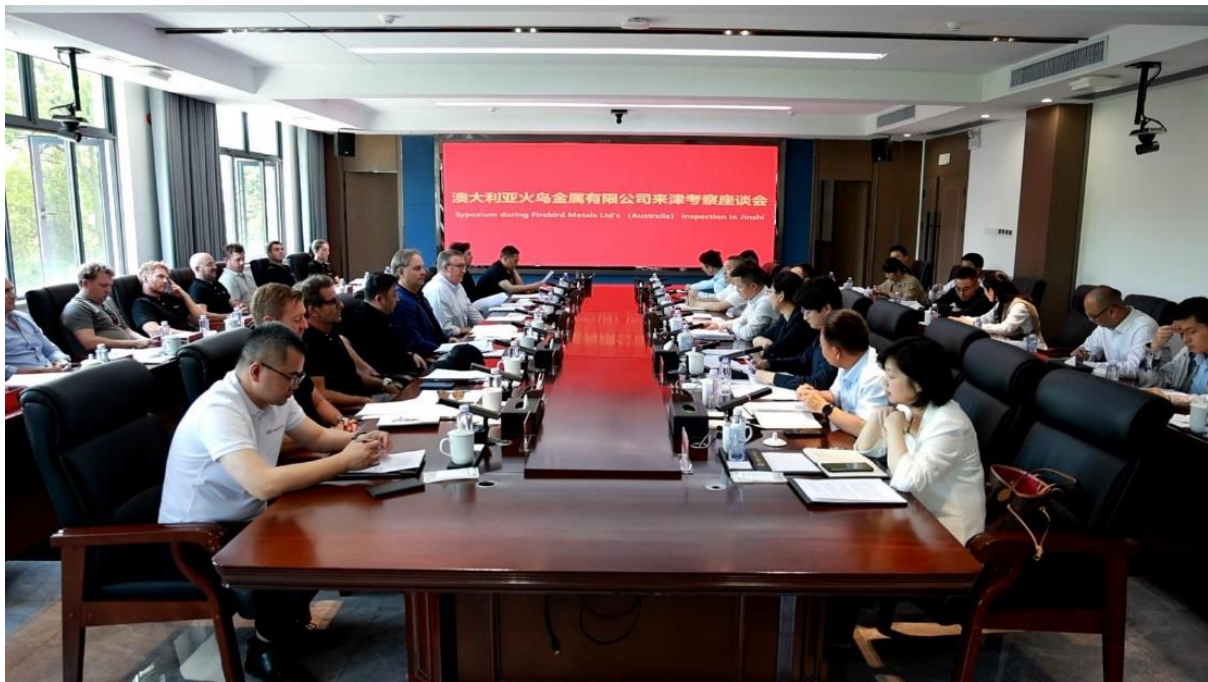
Image 2: Firebird Board and Management, Site Visit Investor Group, China Chemical and local Jinshi Government