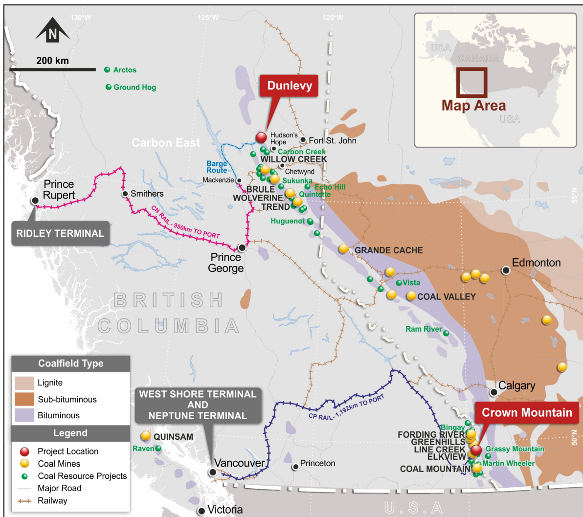
Figure 1 – Project Location Plan

The Company’s two projects are located in British Columbia, Canada which are shown in Figure 1 Location Plan below.