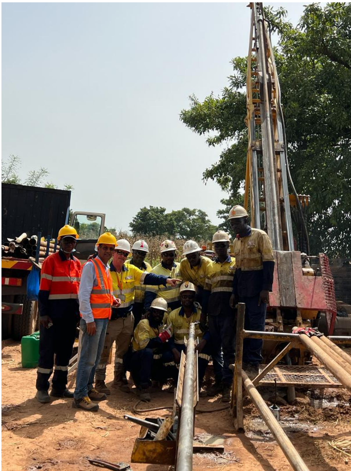
Figure 4: Phase one diamond drilling completed at Blakala